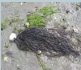
Figure 1 and Table 1 summarise the results of the 2010 macroalgal mapping of Jacobs River Estuary. Relative to the rest of the estuary, the well flushed Central Basin had the lowest cover of macroalgae, while the highest densities were found in the more sheltered embayments (where the red alga Gracilaria was dominant), and along channel margins (where the green alga Enteromorpha was dominant). Ulva (sea lettuce) was present throughout the lower estuary, but at low densities.