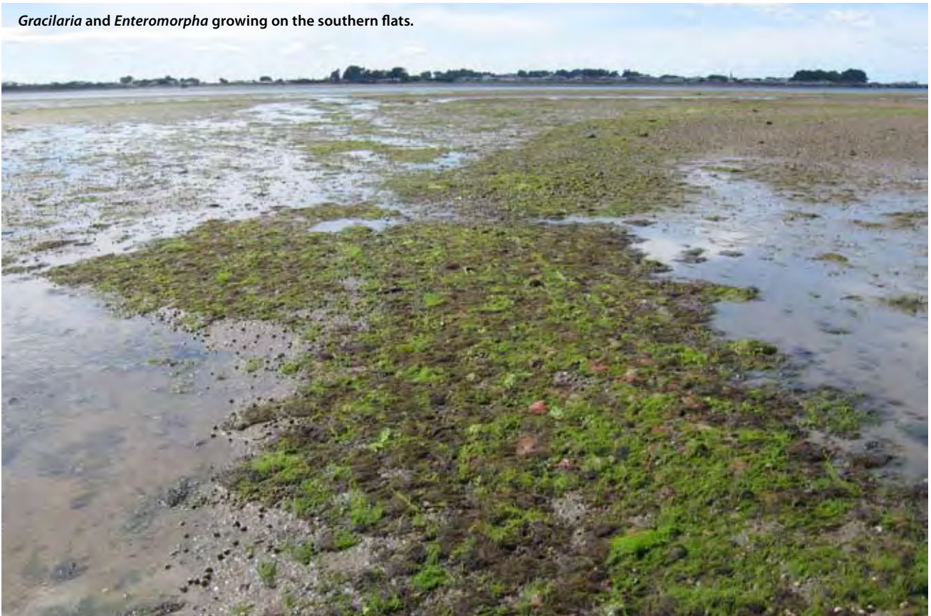
Gracilaria and Enteromorpha growing on the southern flats.