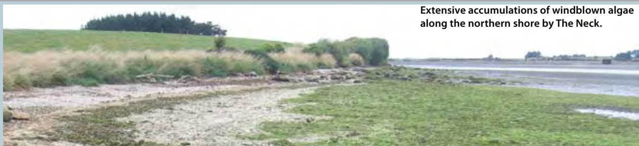
Extensive accumulations of windblown algae along the northern shore by The Neck.