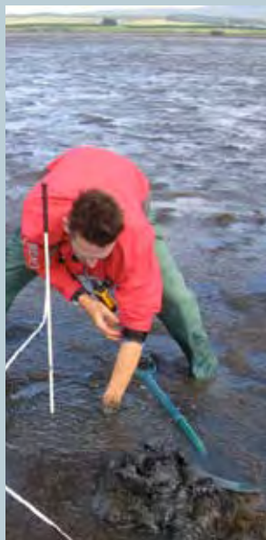
100% cover of Gracilaria growing in anoxic muds in the Pourakino Arm.