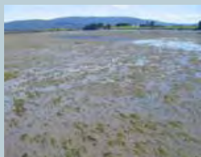
Enteromorpha growing by the Pourakino River channel.

As in 2007, 2008, and 2009, the areas of highest percentage cover (>50% cover) in 2010 were on the soft muds of the Pourakino Arm, and on the Southern and Northern Flats of the estuary (Figure 1). These areas support extensive growths of Gracilaria and act as settling areas for algae carried in from around the estuary by the tide and prevailing wind. They also receive drainage from agricultural lands bordering their margin, along with sediment and nutrients from wider afield, including marine sources.