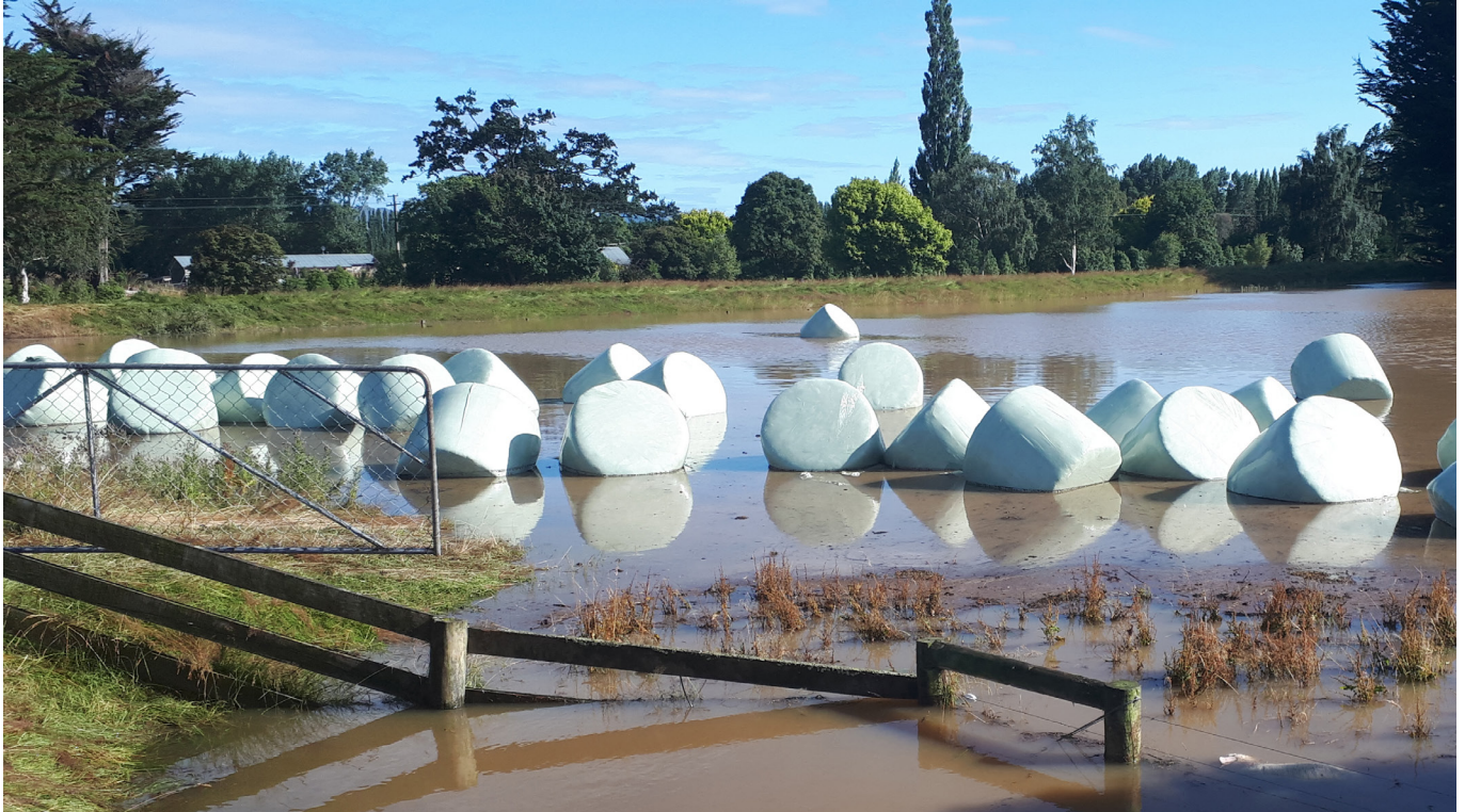
Baleage moved by flood waters

Flooding is a frequent and natural event in Southland that can damage properties, infrastructure and disrupt business. To reduce damage and disruptions, Environment Southland has constructed significant flood control infrastructure and maintains over 450 kilometres of stop banks through flood control works.