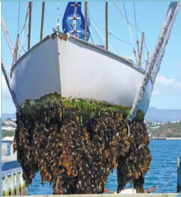
WITHOUT A CLEAN OR ANTIFOULING FOR THREE YEARS