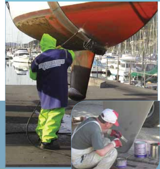
WATERBLASTING AND ANTIFOULING