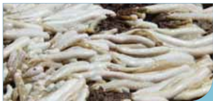
Eudistoma elongatum sea squirt on a beach in Northland