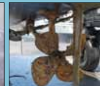
PAY SPECIAL ATTENTION TO THESE AREAS