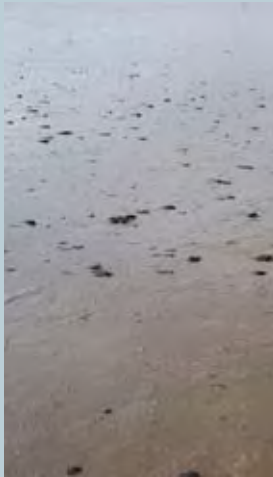
Figure 1 and Table 1 summarise the results of the 2010 macroalgal mapping of Fortrose Estuary. Across the vast majority of the estuary (194Ha, 91%), macroalgal cover was below 50%, with the highest densities of macroalgae growing predominantly in the well flushed lower intertidal reaches of the Central Basin and Eastern Flats. Nuisance conditions of anoxic muds and sulphide odours were uncommon and largely restricted to localised areas in the estuary where wind and current-deposited macroalgae accumulates (predominantly along the eastern shoreline).

The green alga Enteromorpha was the most common species in the estuary and dominated the red alga Gracilaria in all areas of the estuary, including subtidally. The most extensive macroalgal growths were in subtidal areas wherever substrate allowed macroalgae to gain a foothold, while Enteromorpha was most common intertidally along the edge of the river channel margins.