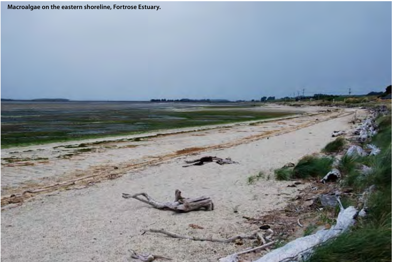
Macroalgae on the eastern shoreline, Fortrose Estuary.