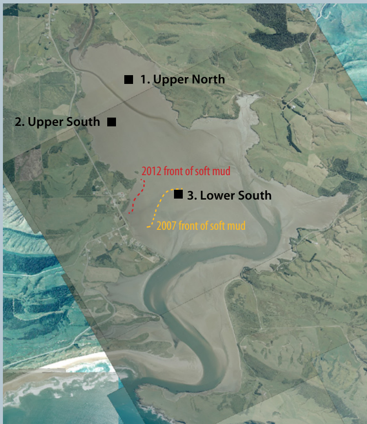
Figure 1. Location of sediment rate monitoring sites in Waikawa Estuary and the position of the soft mud front in the middle estuary.

Prepared by for Environment Southland by Leigh Stevens and Barry Robertson, Wriggle Coastal Management.