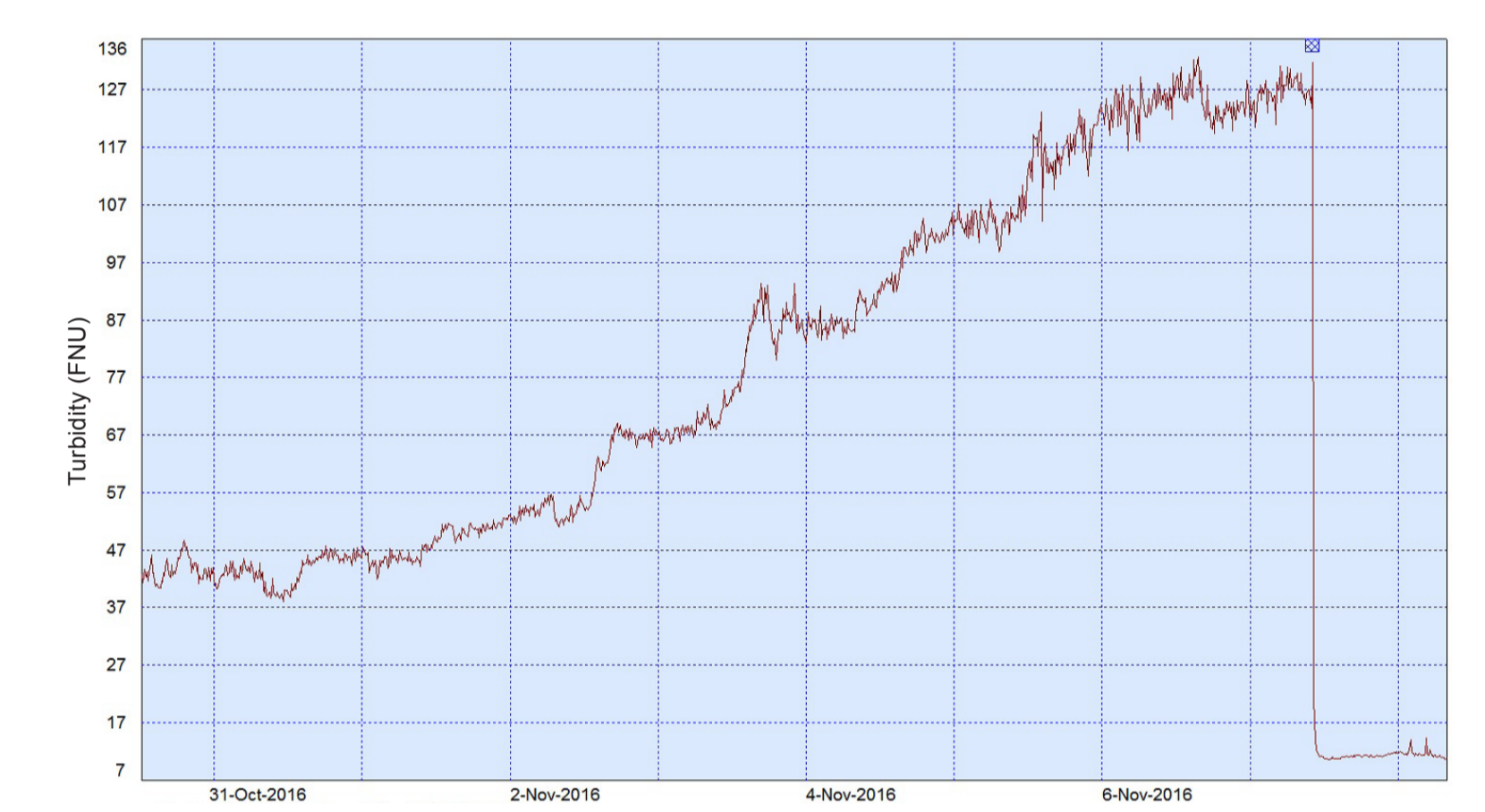
▲ Figure 4: Evidence of sensor drift due to bio fouling on the Hamilton Park turbidity sensor. The drop in recorded values is significant once cleaning of the turbidity sensor has occurred.

Maintenance and verification measurements are carried out at each of the sites on a monthly basis, to ensure the accuracy of the continuous water quality data. Handheld water quality meters are used to verify the conductivity, water temperature and dissolved oxygen values, and grab samples are taken to verify turbidity, SSC, and phosphorus and nitrogen concentrations