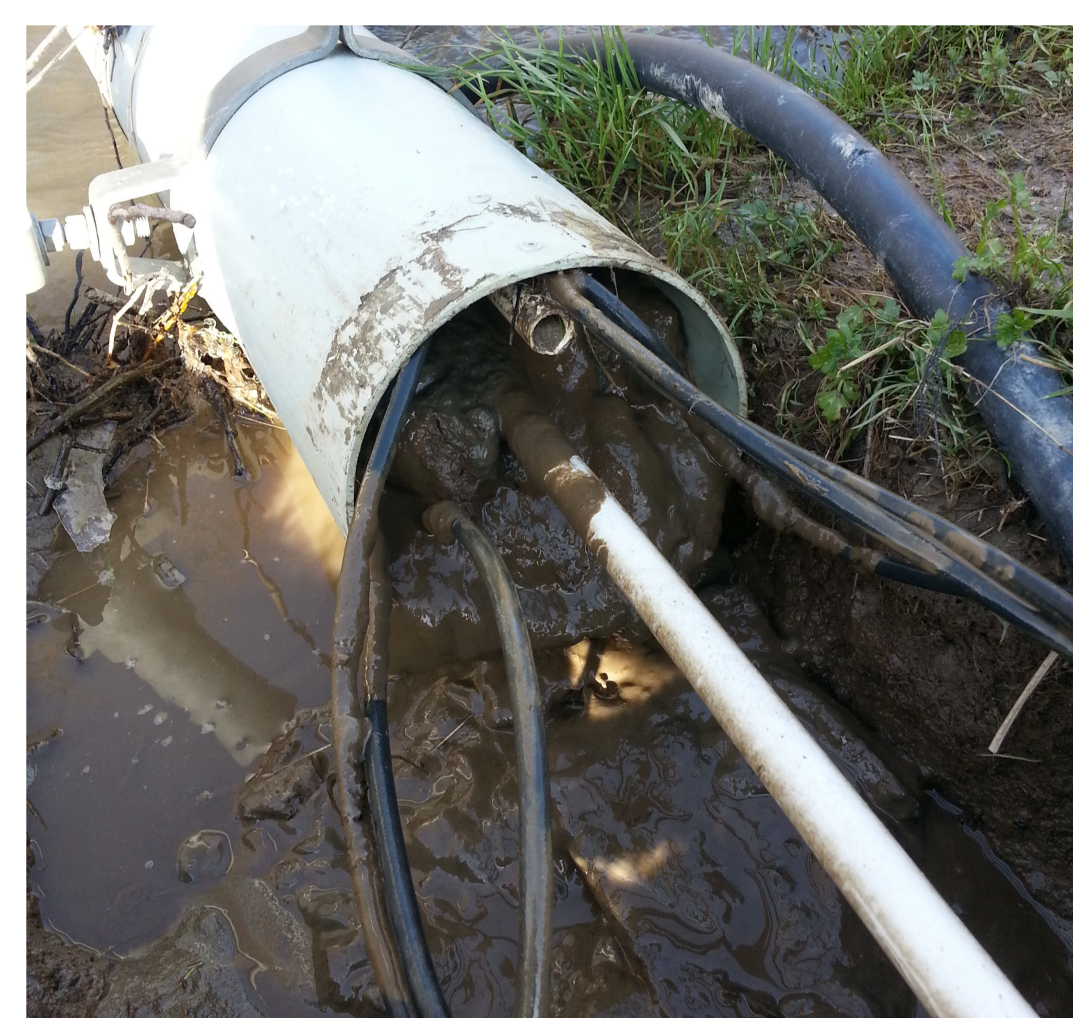
▲ Figure 2: The result of significant sediment accumulation at the Waikaka Stream at Hamilton Park site.