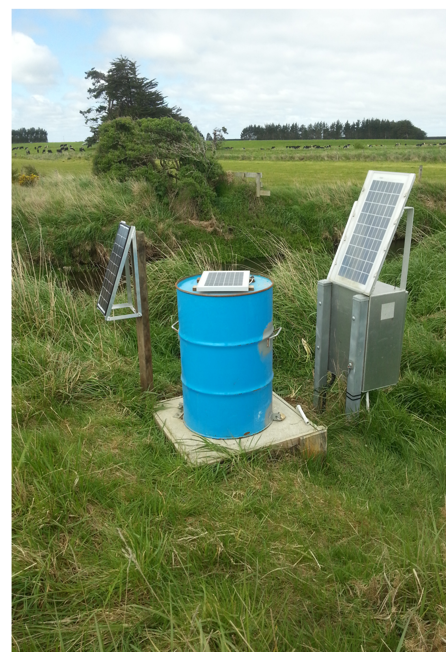
▲ Figure 3: The automatic water sampler set up at the Waimatuku Stream at Waimatuku Township Road site. The automatic sampler is located under the barrel for protection and has a separate solar panel for battery recharge.