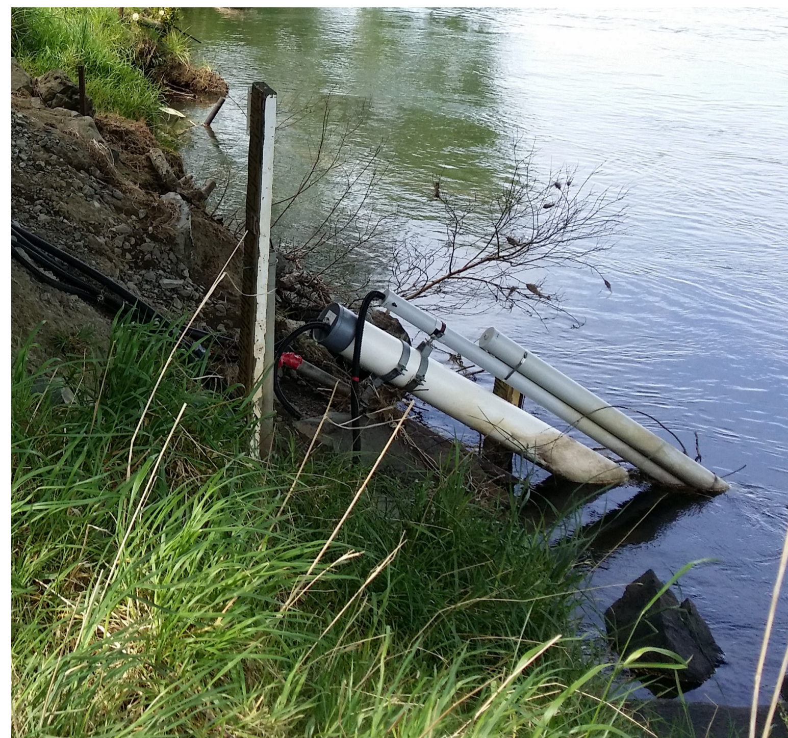
▲ Figure 1: Aparima River at Thornbury site showing the water quality instruments housed in the PVC pipes. The automatic sampler for this site is located inside the container.

The automatic samplers are powered by battery which is recharged by a solar panel (Figure 3) or by mains power if available. After installation at a site, the automatic samplers are programmed to receive commands via SMS messages. The technicians must ensure that each sampler's modem has adequate reception to enable activation messages to be received, as well as calibrate sample volumes and suction hose lengths.