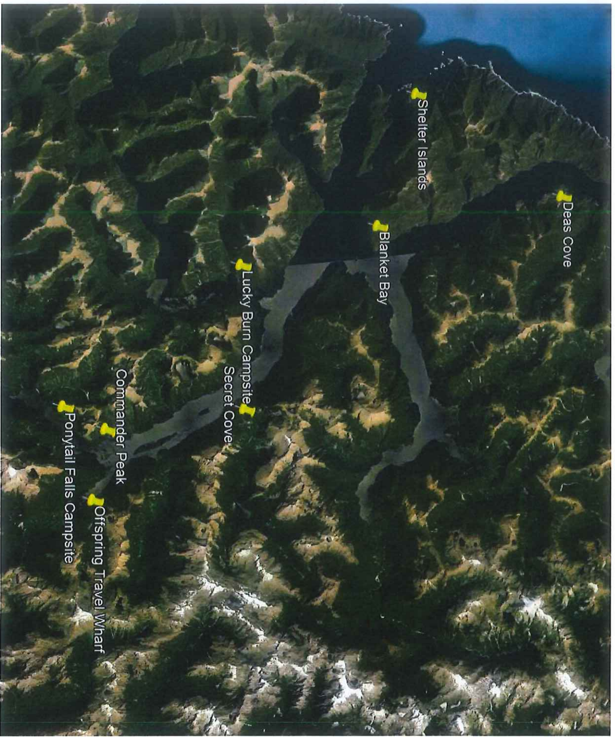
Map 1: Plan showing various landmarks and locations as referred to in the application.