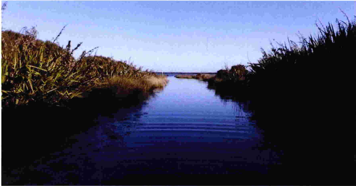
Image: high waters- Boat entrance at end of Moffat Road – usually can drive down to the bottom and back the boat in.