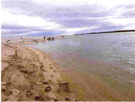
Image: Waituna open at Walkers Bay

We are submitting in support of this application because if this application is not granted then we will be adversely affected.