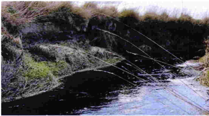
Image: A major issue is Banks slumping in from feeder creeks Location; Moffat creek.