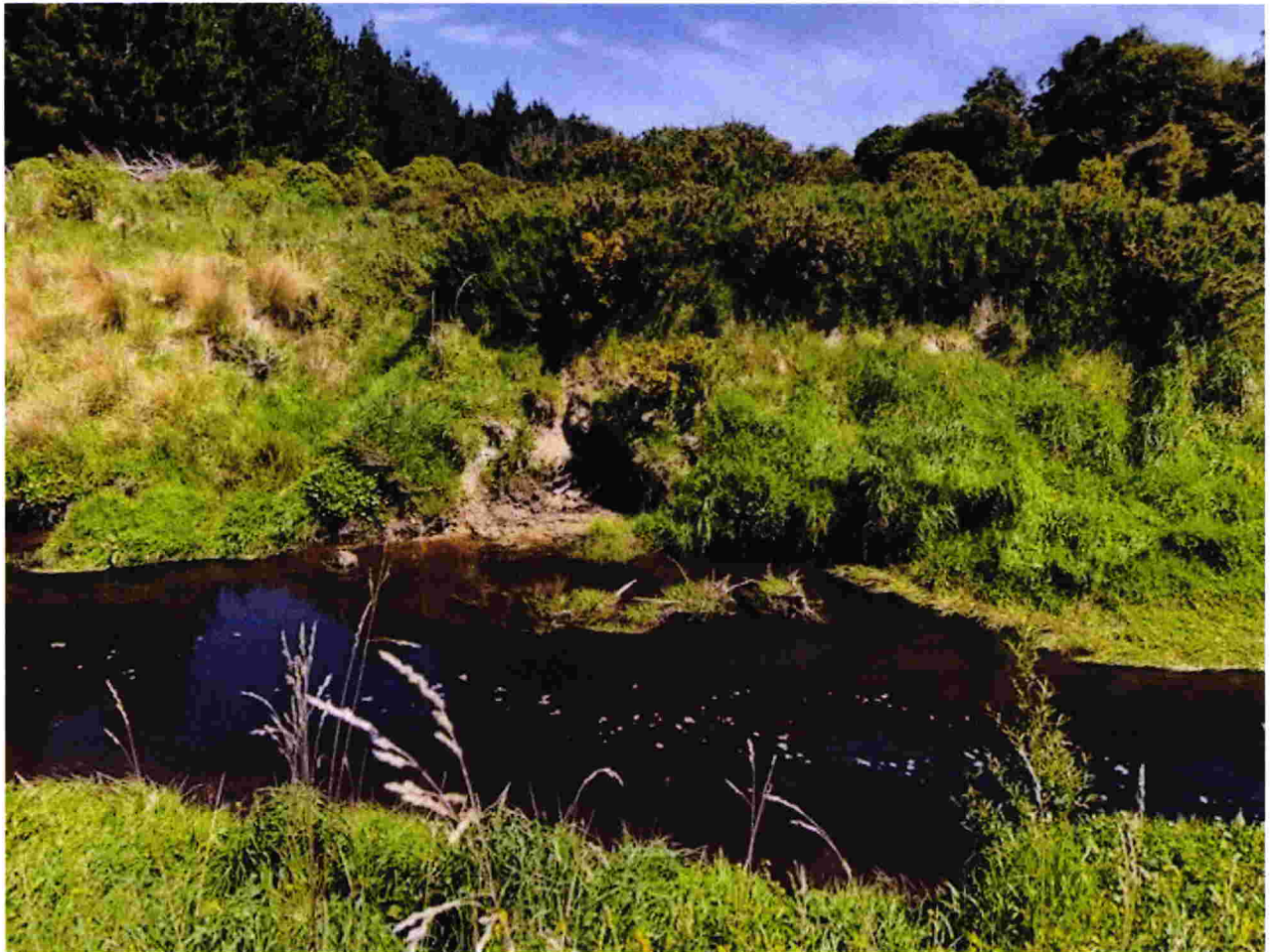
Photo above taken November 2021 showing erosion – was it as a result of the punched in log on the west side of the creek or the one on the east side?