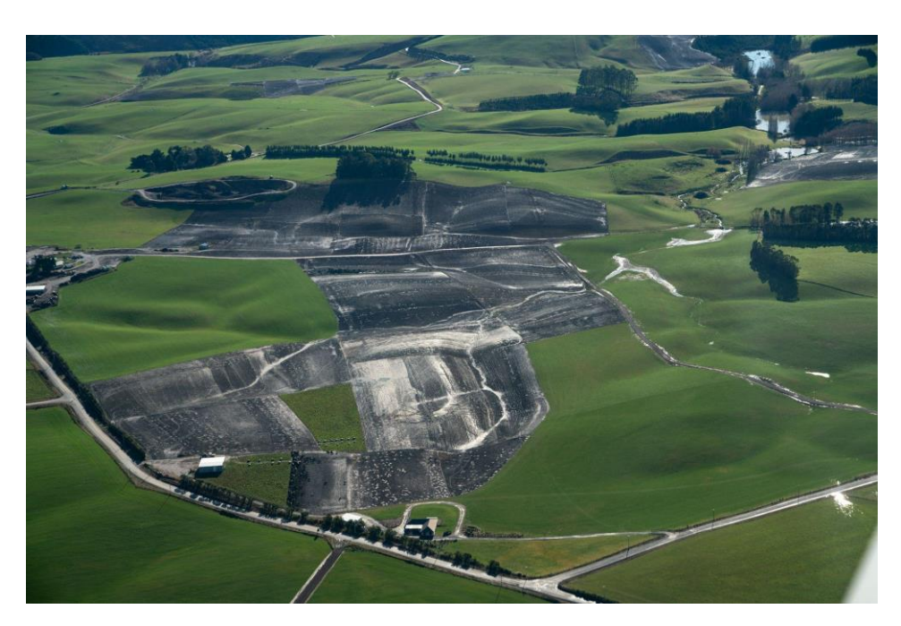
Image showing surface pooling, ephemeral streams and receiving water body.

27. The intake of microbes and nitrates through contaminated water presents a human health risk (e.g., gastroenteritis and organ dysfunction). Nitrogen derivatives entering