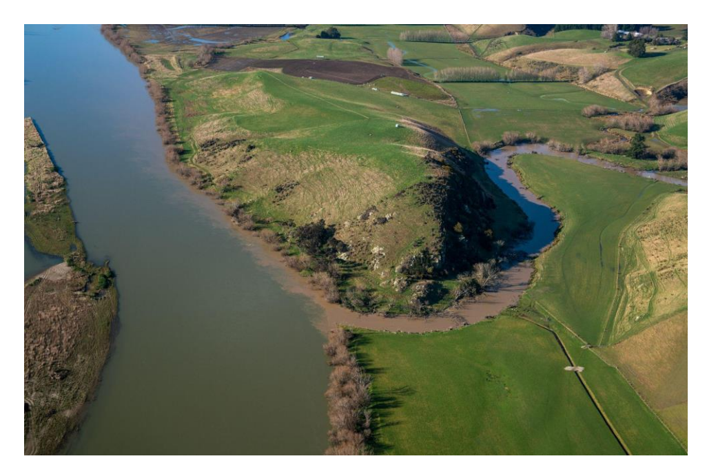
Image showing sediment from Pomahaka River entering the Clutha River

waterways accelerate algal growth which is toxic to rivers<sup>10</sup> and animals.<sup>11</sup> In addition, from the animal perspective, sediment in the waterways blocks light, harms fish gills, reduces visibility for fish, alters water flow patterns and when it settles in the interstitia, covers or affects access to the habitats of the waterway's inhabitants.<sup>12</sup>