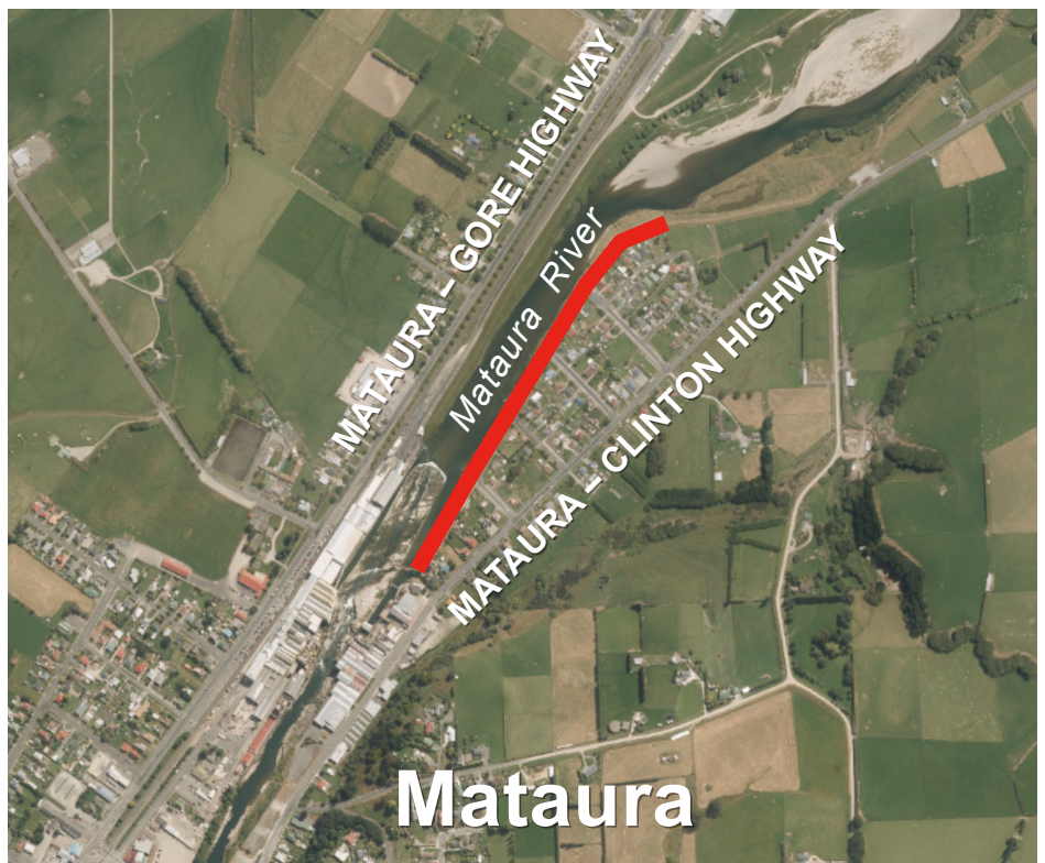
The section of Mataura stop bank (shown in red) could be at risk in the event of a flood.

We are prioritising works for this stop bank upstream of the old Mataura paper mill, however the true right riverbank will also need monitoring and protection works in future.