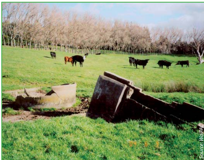
Outline of former plunge dip

Regional Councils are able to apply for Government funding to assist with the remediation of contaminated land, which will provide part of the costs if an application is successful.