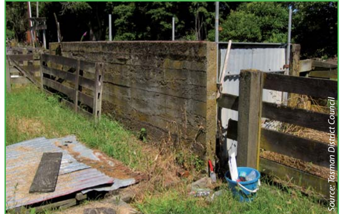
Rectangular shower dip with sump (under corrugated iron)

arsenic if they are collected from surface water downstream of a sheep dip or from a bore located within 300 metres of a sheep dip. Meat, eggs and vegetables raised on a sheep dip site are potential sources of human exposure to arsenic. Eating wildfoods (freshwater mussels, koura and watercress etc.) collected downstream from a sheep dip may also be a source of arsenic exposure. Mushrooms and edible plants (e.g. puha) or ferns should not be collected from the vicinity of a sheep dip.