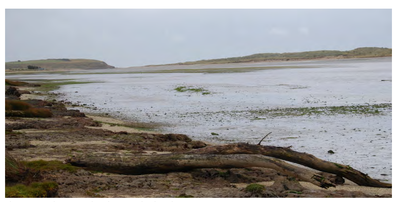
Ulva (Enteromorpha) growing along the eastern shoreline adjacent to Fortrose.