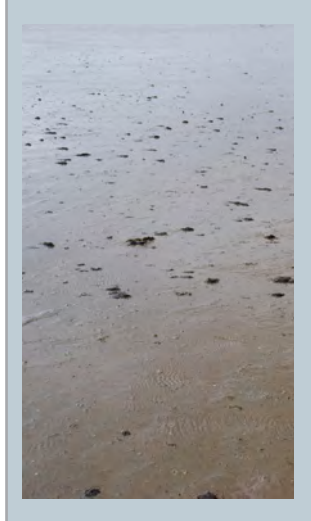
Gracilaria on the eastern flats of Fortrose Estuary.

Figure 1 and Table 1 summarise the results of the 2011 macroalgal mapping of Fortrose Estuary. Across the vast majority of the estuary (202Ha, 94%), macroalgal cover was below 50%, with the highest densities of macroalgae growing predominantly in the well flushed lower intertidal reaches of the Central Basin and Eastern Flats. Nuisance conditions of anoxic muds and sulphide odours were uncommon and largely restricted to localised areas in the estuary where wind and current-deposited macroalgae accumulates (predominantly along the eastern shoreline). Broad scale mapping (Robertson et al. 2003) reported only 3% of the estuary was dominated by soft mud, with no significant macroalgal growth observed in these areas in 2011. Consequently, there were no areas exhibiting gross nuisance conditions.